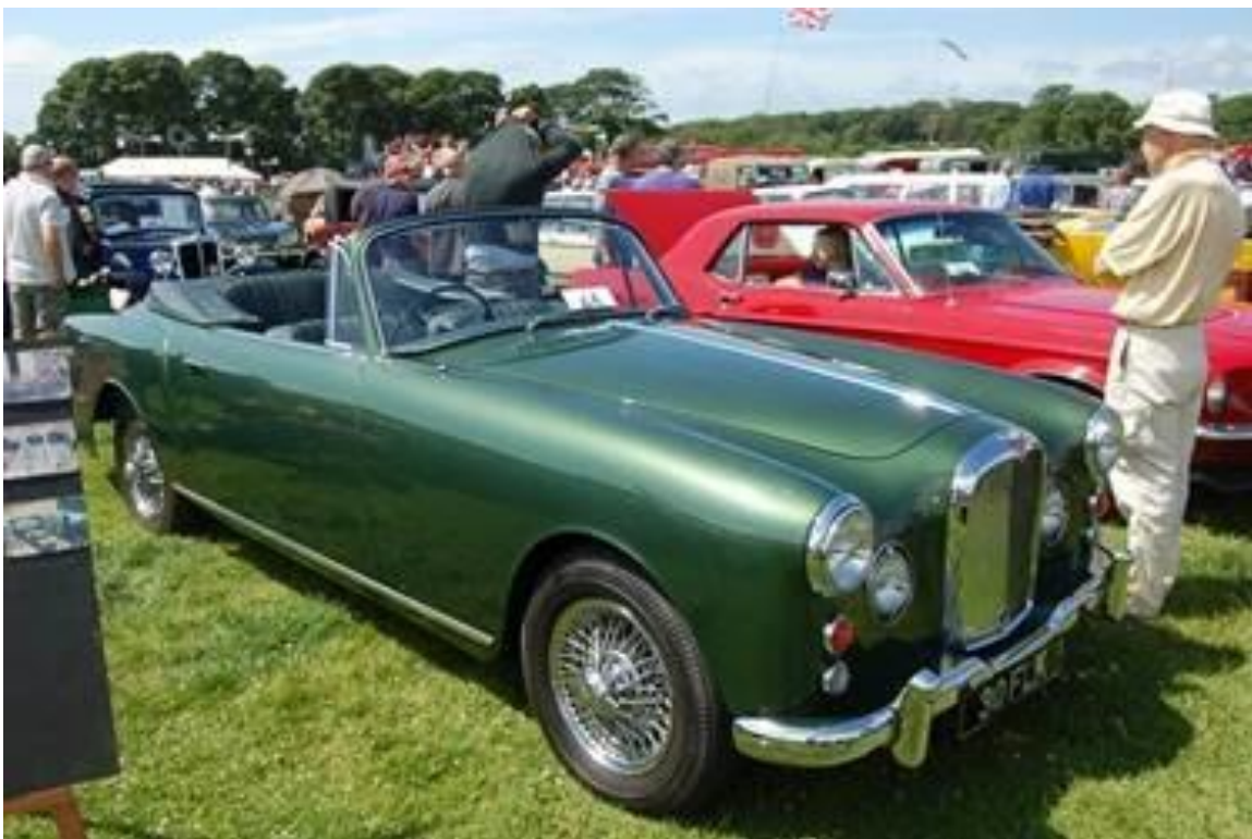
Anyone looking for a nice Alvis the owner I was told would be prepared to sell if you have a spare 100k.