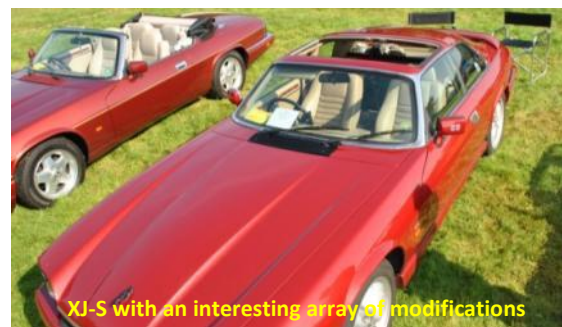
XJ-S with an interesting array of modifications