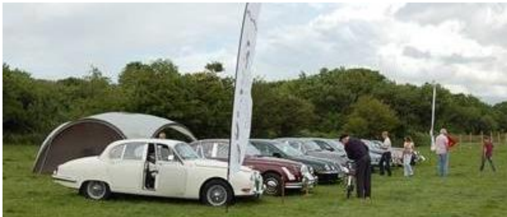
This gentleman was asking if we would take his bike in part exchange for one the cars, cash adjustment either way of course!