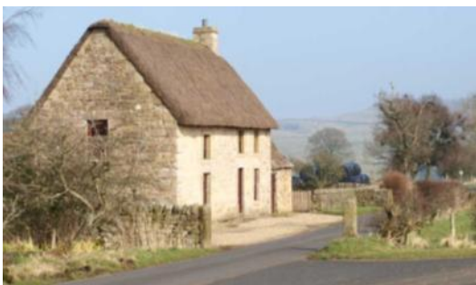
Causeway House on Stanegate, one of very few thatched cottages in Northumberland