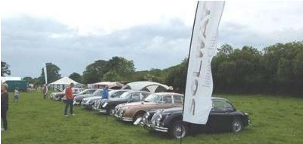
A good presentation of classic Jaguars from the Solway Club.